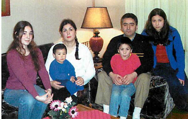
He and his wife have 2 sons and 2 daughters. He is the FGBMFI National President of Chile.

But we had a lot of communication problems in our marriage. At one point, we were very near separation. It was difficult, but we continued to go to the Lutheran Bible study. Then a former FGBMFI Chapter president from England came to minister. When he ministered to my wife and me, a lot of ugly, but true, words of knowledge came from his lips about me. However, after that, my marriage was changed and healed. That was a beautiful year for us in our marriage. We began to pray together.